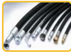
Petroleum Transfer Hydraulic Spiral Hose per SAE 100 (35~703bar Pressure, 4:1 Safety, HTS Wire Braid, 6~100 mm bore ID)