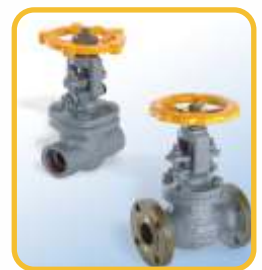
Isolation Plumbing Acid and Alkaline Control Gate Valve per ISO 5996 (Screwed/Socket/Butt weldable, SS/CS/Forged steel Body, Pressure 300~1500class, PTFE/Grafoil Seal, 1/2~12 inch Size)