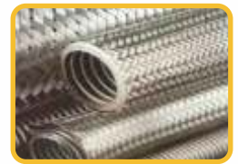
Acid, High Temperature SS Corrugated Flexibe Hose per BS 6501, ISO 10380 (5~275bar Pressure, SS 304/316/321, 1/2/3 wire Braid, MS/SS304 Threaded or Flanged Fitting, 10~400 mm bore ID)