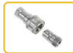
Air and Water Push Pull Fast Coupling per ISO 7241 (10~350bar Pressure, SS 304/316/CS/Brass, Double check valve/Single valve/Through type/NRV, Nitrile/Silicone/Viton Seal, Coupler/Adapter/ Complete set, 1/8~3 inch Size)