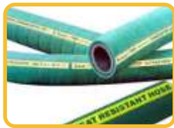
Non Conductive Furnace Hose as per ISO 8330 (10/15bar Pressure, 4:1 Safety, Fire-proof~1000°C/ Asbestos~460°C, 12.5~150 mm bore ID)