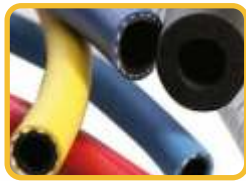
Delivery Hose Steam as per IS 10655, Water per IS 444, Air per IS 446, Gas Welding per IS 447 (5/7/10/14/16/20bar Pressure, 4:1 Safety, Braided/Textile Ply, 8~100 mm bore ID)