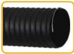
Mud Water Suction as per IS 3549, Chemical per IS 7654, Slurry per EN 287, Petroleum per IS 10733, Bulker Fly Ash Hose per IS 8189 (10/15/18bar Pressure, 3:1 Safety, Armored, 50~457 mm bore ID)

Kink-less Armored Slurry Suction, Steam Delivery, Water Blast Hydraulic High Pressure Rubber & SS Braided Hoses