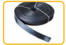
Layflat Rubber Water Discharge Hose as per ISO 4641 (10/15bar Pressure, 3:1 Safety, Spiraled Ply, 40~203 mm bore ID)