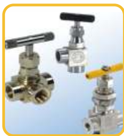
Gas and Fluid Flow Control Needle Valve per ISO 10423 (Screwed/Flanged, Straight/Angular Port, SS/CS/Brass Body, Pressure 20~500bar, PTFE/NBR/FPM/Grafoil Seal, 1/8~2 inch Size)