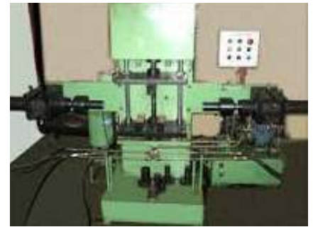
Water and Dust Penetration Test Apparatus

RFQ at: belts@universaldelhi.org ; universal@hic-india.com ; export@hicrubber.com