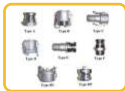
Camlock Fittings Hose Coupling as per MIL-C-27487, EN 14420 (17~35bar Pressure, SS 304/316/CS, Adaptor(F) part:A/Coupler(M):B/Hose Shank Coupler:C/Coupler(F):D/Adaptor:E/Adaptor (M):F/DC/DP, 1/2~6 inch Size)