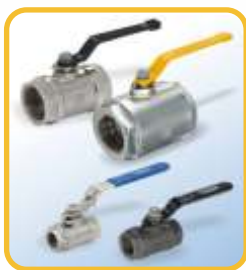
Water Shut-Off High Pressure Ball Valve per IS 9884, API 598 (2/3/4Way/3pc, Screwed/Flanged, Directional L/T/Full bore/Reduced Port, SS/CS/Forged steel Body, Pressure 50~1000bar, PTFE/GFT/ CFT/POM/PEEK Seal, 1/4~6 inch Size)