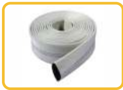
Canvas Rubber Lined Fire Hose as per IS 636, Reel per IS 884 (10/12/14/16/18bar Pressure, 3.2:1 Safety, Single Jacket EPDM, Galvanized Steel/ SS 304, Gunmetal/ SS Nozzle, 25~152 mm bore ID)