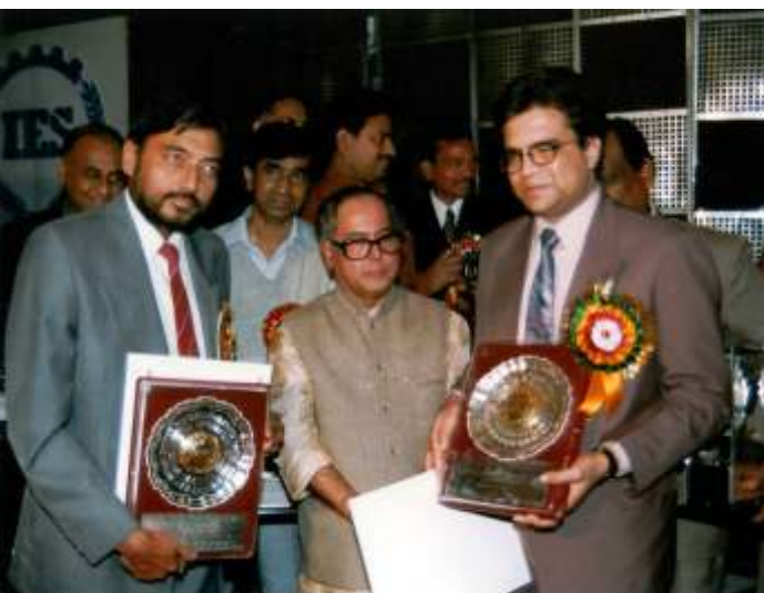
Export Award Honoured in Feb 1997

RFQ at: belts@universaldelhi.org ; universal@hic-india.com ; export@hicrubber.com