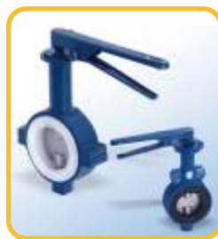
Beverages Flow Control Wafer type and Welded type Butterfly Valve per ISO 5752 (Wafer/Flanged, SS/CS/Cast Iron Body, Pressure 20~500bar, Nitrile/EPDM/PTFE Seal, 2~16 inch Size)